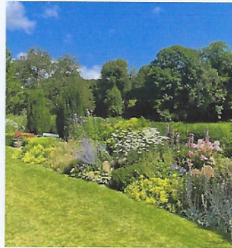
for those coming from afar. Chalk Pyt Gardens