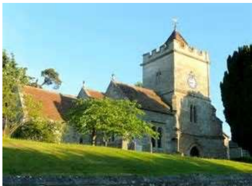
Holy Trinity, Bowerchalke

Bowerchalke (pop 280) is a ribbon development, nearly two miles from end to end, set in the Cranbourne Chase Area of Outstanding Natural Beauty, with farms surrounding it. It has a stream fed from a spring that rises in the natural basin that joins the Ebble River and supports a fish farm. It is, in the main a close- knit community of all ages. The “outstanding” Broad Chalke School is a draw for those with young children. There is a monthly farmers market in the Village Hall, and other community events provided by Church and Village Hall supporters.