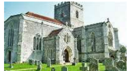
St John the Baptist, Bishopstone