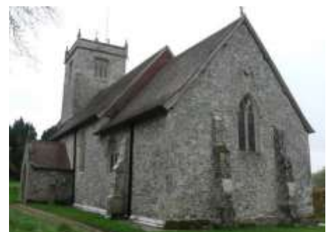
St John the Baptist, Ebbesbourne Wake