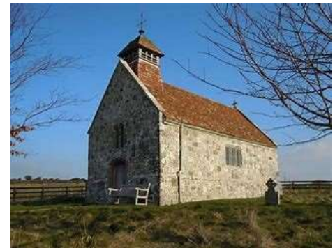
St Martin, Fifield Bavant