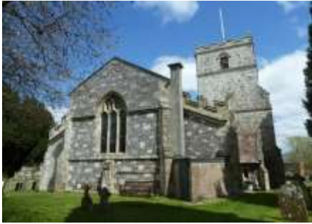
St Michael & All Angels, Coombe Bissett

Coombe Bissett is a medium sized village on the cross roads where the valley East- West road meets the Salisbury-Blandford road. Homington is a little over one mile down the valley road, easy walking distance across Homington Down. The villages (pop 690) are both extremely friendly. Coombe Bissett enjoys the prominence of the church of St Michael and All Angels and benefits from an excellent village shop, small church primary school and a pub. Homington is a much smaller village, with its pretty church of St Mary. There are a few families in both villages.