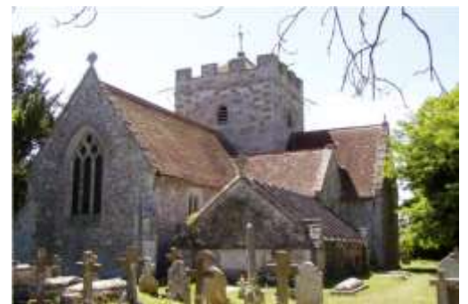
St Peter, Britford

The ancient village of Britford (pop 560) is 1 mile south of Salisbury, with beautiful views of the Cathedral from the water meadows. It is a small community with no shop, but proud of a very successful cafe with delicious homemade food. Longford castle is at the southern end of the village, there is a fish farm and two other farms and for centuries the sheep fair was held in Britford. Longford C of E Primary school serves children from the surrounding area. There are a few families in Britford with children but most of the residents are retired.