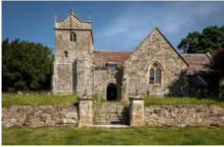
St Mary, Alvediston