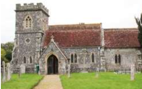
St Andrew, Nunton