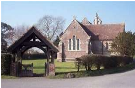
All Saints Charlton All Saints