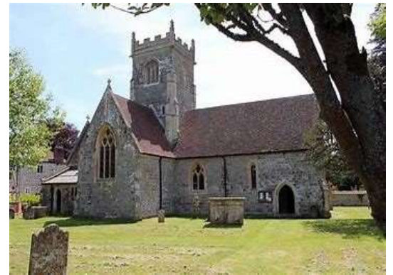
St John the Baptist, Berwick St John

Berwick St John (pop 250) is the westernmost village in the Chalke Valley, and the Benefice. Nestled amongst the chalk downs, the River Ebble rises here. It is a rural community, with four working farms and associated businesses including a blacksmith. There is a pub and Village Hall, both well supported. Berwick is renowned for its community spirit, from street parties for national events to its Harvest Supper and Fete. Above all, it is the home of the biennial Country Fayre, founded by village steam enthusiasts and now a huge event which last year raised over £63,000 for the Salisbury Hospital Stars Appeal.