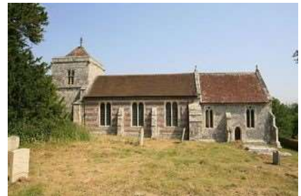
St Mary & St Lawrence, Stratford Tony

Stratford Tony (pop 55) is a small hamlet, alongside the river Ebble. Its delightful church in the care of the Churches Conservation Trust is used for an annual evensong in the summer and the occasional wedding!