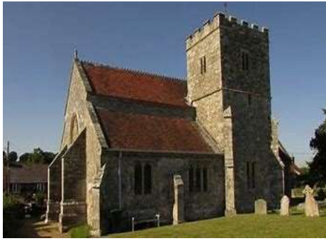
St Mary, Homington