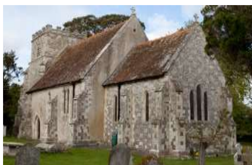
St Mary, Odstock

ONB (pop 550), short for Odstock, Nunton, and Bodenham , is a charming community nestled towards the eastern end of the picturesque Chalke Valley on the eastern edge of the Chalke Deanery. The civic parish boasts two churches, two hospitals (Salisbury District and New Hall), two pubs, a village hall, a nursery school, a dental centre and a local 'milk hut' where fresh milk from the 800 dairy cattle that roam the village fields is sold, and Longford castle. The villages collaborate frequently, pooling their resources and creative abilities, particularly for the annual Christmas 'Review/Panto' which is always a sell-out. The summer Ebbfest, a combined fete and music festival, draws people from a wide area and raises funds for local charities and churches. In the summer months, car boot sales provide regular competition to church services! The Nunton field is used by the local football clubs during the winter.