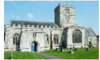
All Saints, Broad Chalke

Broad Chalke (pop 650) sits centrally in the Benefice and has a good mix of age-groups. There is a CofE maintained primary school, a sports centre, a village hall where WI, Flower Club, Film Night are each held once a month and Teddybears (for mums, babies and toddlers) once a week, and a pub – The Queen’s Head. The jewel in our crown is The Hub – a shop (Chalke Valley Stores) and Coffee Shop, situated in the URC building. There are 7 working farm and several small businesses. The village also hosts the internationally famous Chalke Valley History Festival.